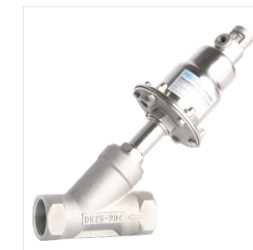
18. PV700S Polished actuator