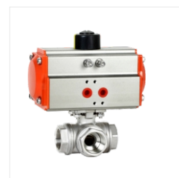
2. VSP3 3 ways pneumatic ball valve