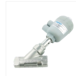
2. PV100P with grey actuator