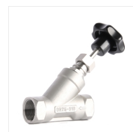
4. MV100P Y type manual angle valve