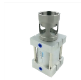
2. EV10 Exhaust valve