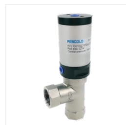
4. DV100C Economical type