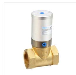
5. GV300A Air control right