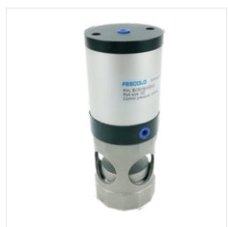
3. EV30 Exhaust valve