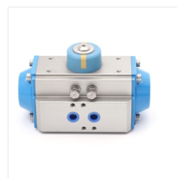
3. VT Pneumatic actuator