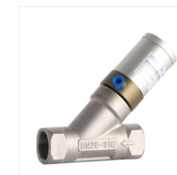
24. PV800A Air control