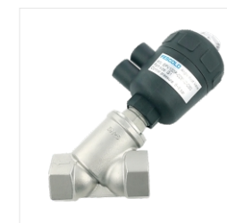
21. EPV100P Economical type