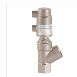
3. PV1527-B 2ways filling valve