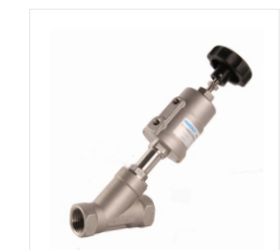
25. PVM Stainless steel