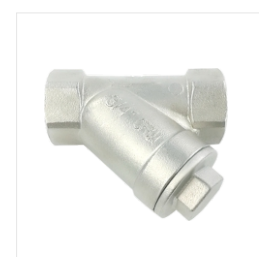
8. CV300Y Y type spring vertical lift check valve