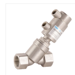
2. PV1527-A 2ways diaphragm valve