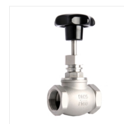
5. MV200 T type manual tight