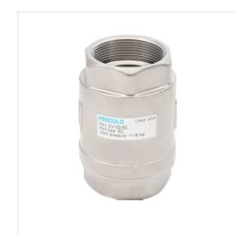
6. CV100 Spring vertical lift check valve