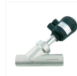
12. PV300P weld end type