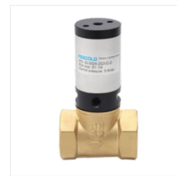
4. GV300A Air control right