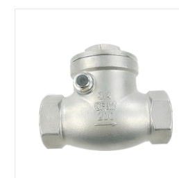
7. CV200 Female swing check valve