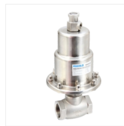
3. GV200S Polished