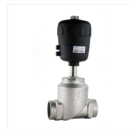
1. GV400 Piston controlled flat-seat valve