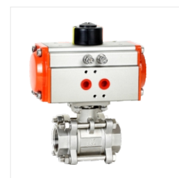
1. VSP2 2 ways pneumatic ball valve