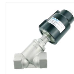
22. EPV100A Economical type