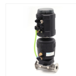
1. DM10 2ways diaphragm valve