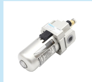
12. AF3000-03 Air lubricator