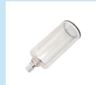
9. PC300F PC cup