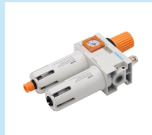
6. MU series Filter+Regulator+Lubricator