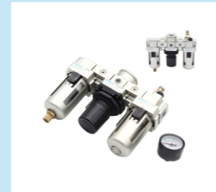
1. AC3000-03 Filter+Regulator+Lubricator