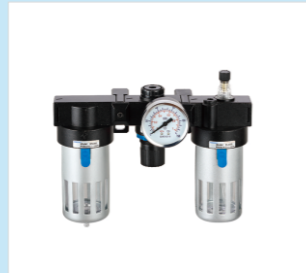
2. BC4000 Filter+Regulator+Lubricator