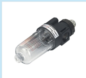
13. AL2000 Air Lubricator