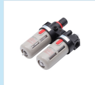
4. BFC3000 Filter+Regulator+Lubricator