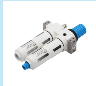
1. OU series Filter+Regulator+Lubricator