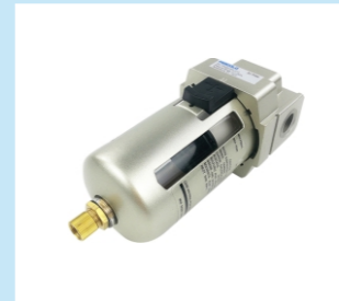
7. AF4000-04 Air filter