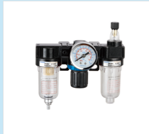
1. AC2000 Filter+Regulator+Lubricator