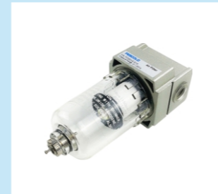
5. AF2000-02 Air filter