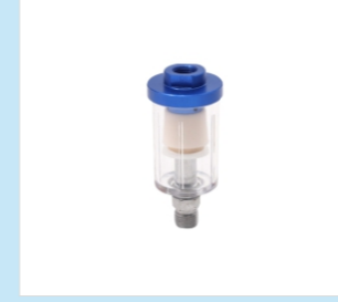
5. DF-02 Air filter