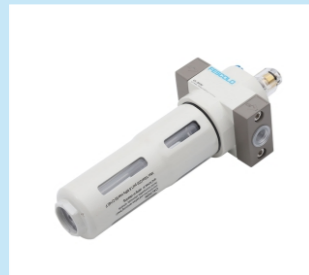
5. OL series Air lubricator