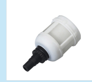
7. AD400-M Autodrain element