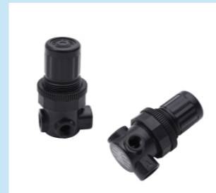
8. NAR Air regulator