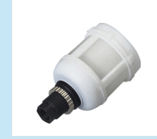
8. AD400-F Autodrain element