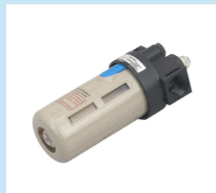
14. BL3000 Air lubricator