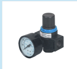
10. BR3000 Air regulator