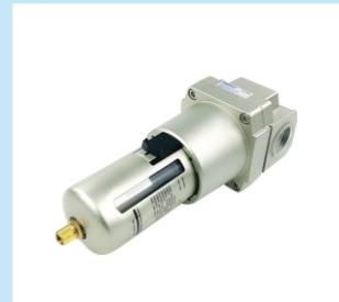
8. AF5000-10 Air filter