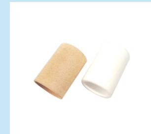
10. PE200 Filter element