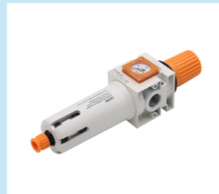
7. MFR series Filter+Regulator