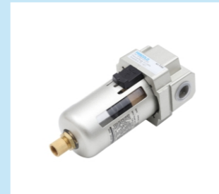
6. AF3000-03 Air filter