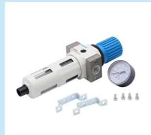
2. OFR series Filter+Regulator