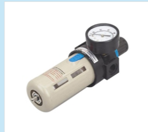
7. BFR3000 Filter+Regulator