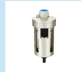
2. SAD402-X-04 End aut drain