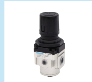
10. AF2000-03 Air regulator