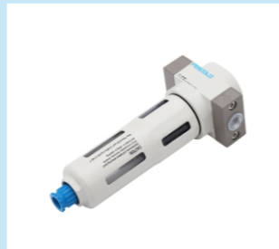
4. OF series Air filter