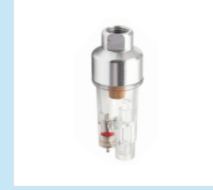
6. EF-02 Air filter