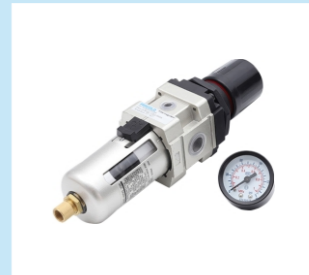
4. AW3000-03 Filter+Regulator