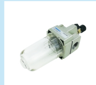
11. AL2000-02 Air lubricator