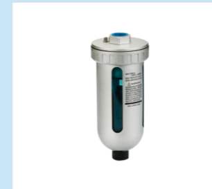
1. SAD402-S-04 End aut drain