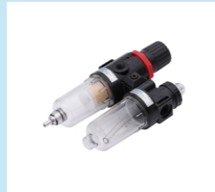
3. AFC2000 Filter+Regulator+Lubricator