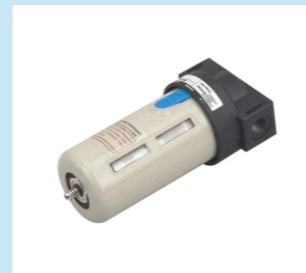
12. BF3000 Air filter