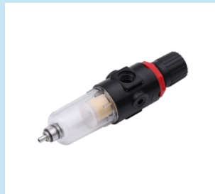
5. AFR2000 Filter+Regulator