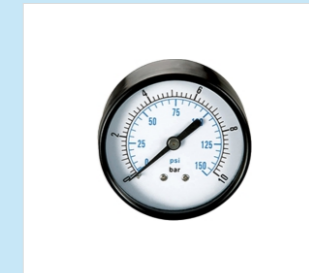
12. SAG-50 Pressure gauge