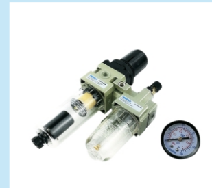
3. AC2010-02D Filter+Regulator+Autodrain