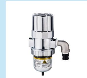
3. AD-5 End auto drain