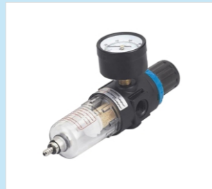
6. AFR2000 Filter+Regulator