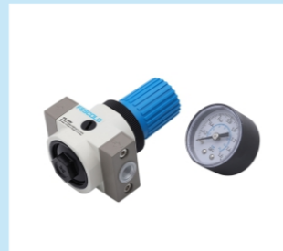
3. OR series Air regulator