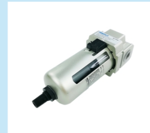
9. AF3000-03D Filter + autodrain