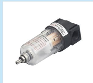
11. AF2000 Air filter