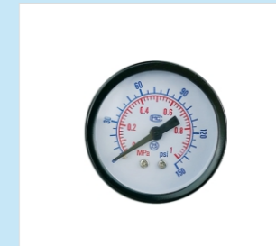
11. SAG-40 Pressure gauge