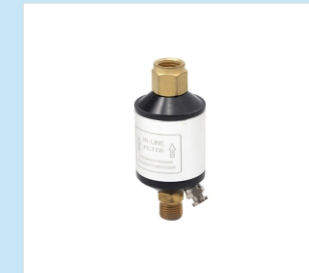
4. CF-02 In line filter