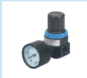
9. AR2000 Air regulator