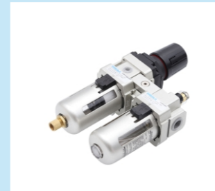
2. AC3010-03 Filter+Regulator+Lubricator