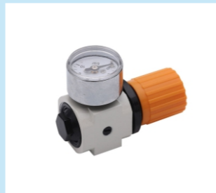
8. OR series Mini type Air filter