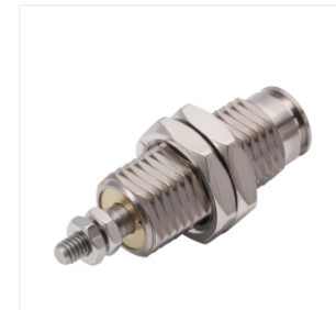
36. Model: CJPB SMC needle air cylinder