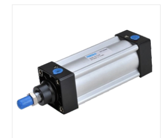
12. Model: SU Airtac standard air cylinder