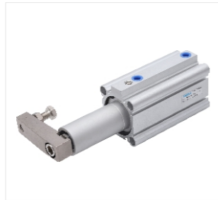
54. Model: MK-3 Rotary clamping air cylinder