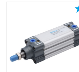
3. Model: ISO (Metalwork) ISO6431 standard air cylinder