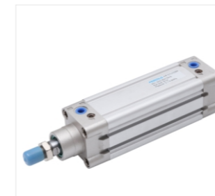
1. Model: DNC ISO6431 standard air cylinder