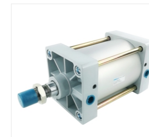
6. Model: SC(big size) Airtac standard air cylinder