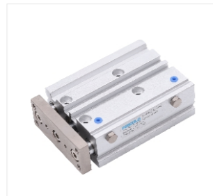
22. Model: MGPM Three rod air cylinder