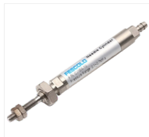
32. Model: CJB6-10 SMC needle air cylinder