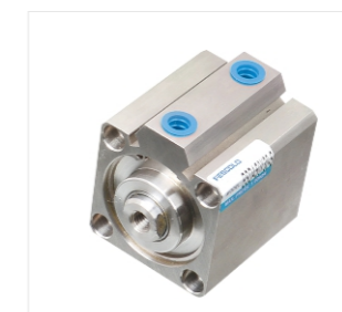
15. Model: BSDA Full stainless steel air cylinder