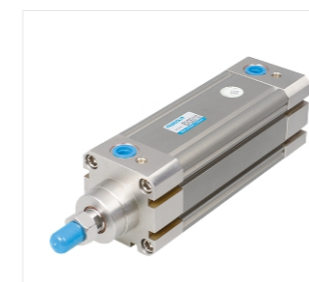
13. Model: BDNC Full stainless steel air cylinder