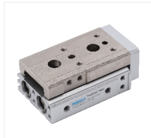
57. Model: MXQ Pneumatic slider