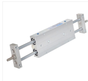
24. Model: STMB Dual rod air cylinder