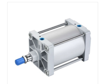
4. Model: DNG ISO6431 standard air cylinder