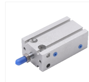
41. Model: CDU Free mounting air cylinder