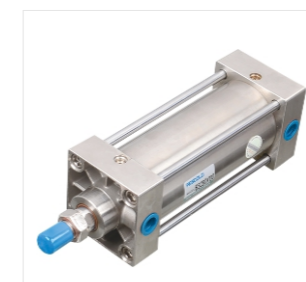
14. Model: BSC Full stainless steel air cylinder