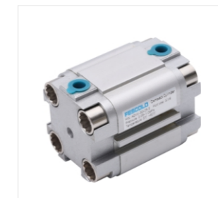
7. Model: ADVU FESTO standard air cylinder