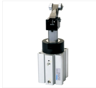
50. Model: RSQB Pneumatic stopper cylinder