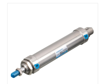
16. Model: BMAL Full stainless steel air cylinder