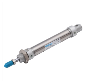
25. Model: DSN ISO6432 standard air cylinder