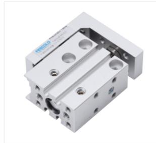
55. Model: MXH Pneumatic slider