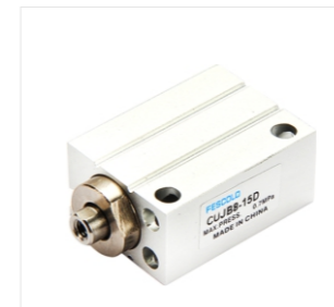
42. Model: CUJB SMC mini air cylinder