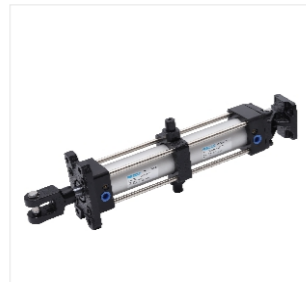
18. Model: CDA2B AIRTAC standard air cylinder