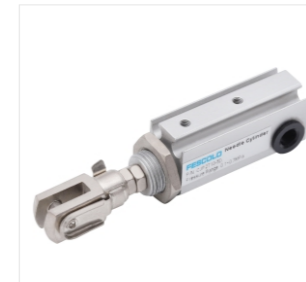
35. Model: CJP2B SMC needle air cylinder