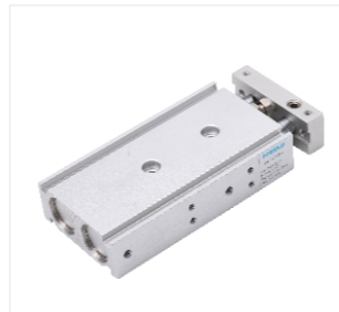
20. Model: CXSM Dual rod air cylinder