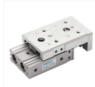
56. Model: MXS Pneumatic slider