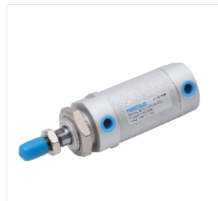
27. Model: MAL AIRTAC standard air cylinder