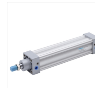
2. Model: SI ISO6431 standard air cylinder