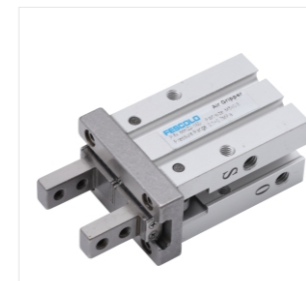
46. Model: MHZ2 Pneumatic gripper