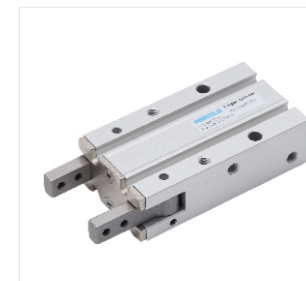
47. Model: MHY2 Pneumatic gripper