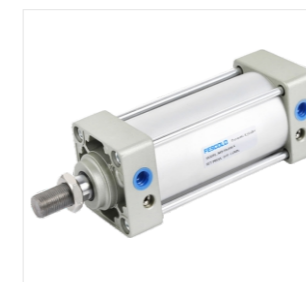
10. Model: MBB SMC standard air cylinder