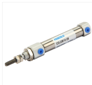
29. Model: CDJ2B10-25 SMC standard air cylinder