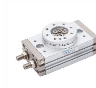
43. Model: MSQ Pneumatic rotary table