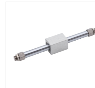
37. Model: CY1B Rodless air cylinder