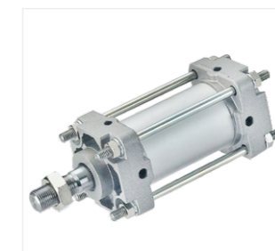
11. Model: CA1B Standard air cylinder