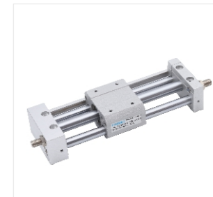
39. Model: CY1S Rodless air cylinder