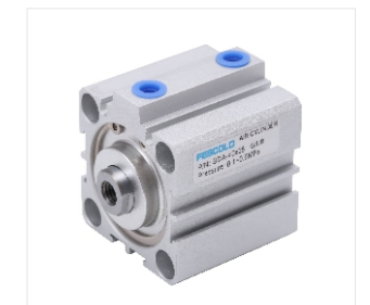
8. Model: SDA Airtac standard air cylinder