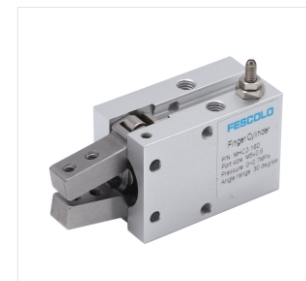
48. Model: MHC2 Pneumatic gripper