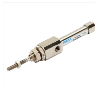
30. Model: CDJ2B6-50R SMC standard air cylinder