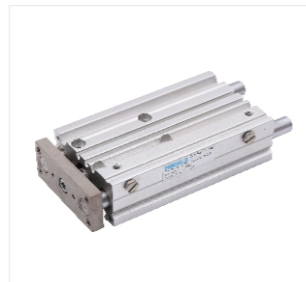
23. Model: MGPM-N (new type) Three rod air cylinder