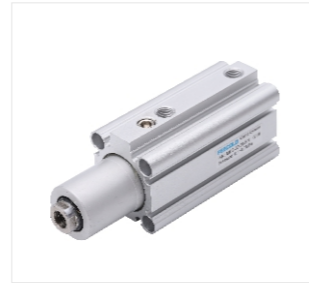
52. Model: MK Rotary clamping air cylinder