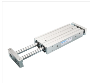
21. Model: CXSW Dual rod air cylinder