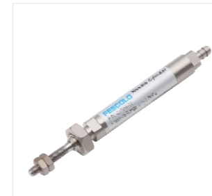
33. Model: CJ2B SMC needle air cylinder