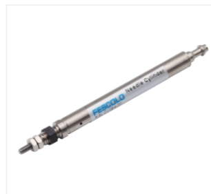
31. Model: CJB4-20 SMC needle air cylinder