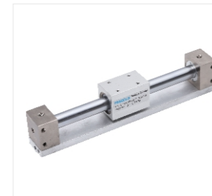
38. Model: CY1R Rodless air cylinder