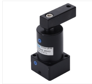
51. Model: SRC Rotary clamping air cylinder