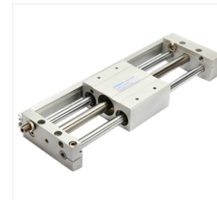
40. Model: CY1L Rodless air cylinder