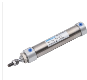
28. Model: CDJ2B16-50 SMC standard air cylinder