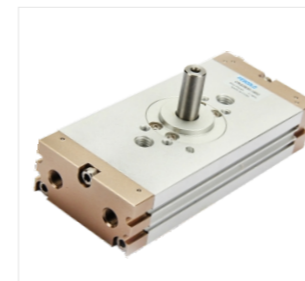
45. Model: CRQ Pneumatic rotary table