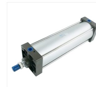
5. Model: SC Airtac standard air cylinder