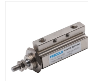
34. Model: CDJPB SMC needle air cylinder