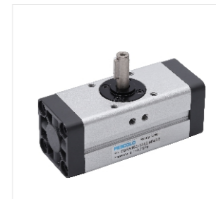
44. Model: CRA Pneumatic rotary table