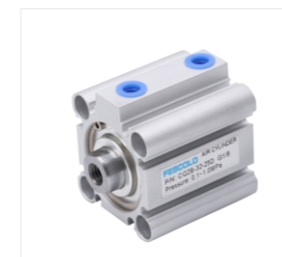
9. Model: CQ2B SMC standard air cylinder