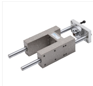
17. Model: FENG FESTO air cylinder guide