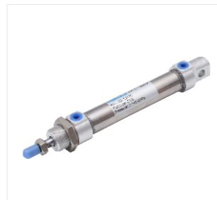
26. Model: MA AIRTAC standard air cylinder