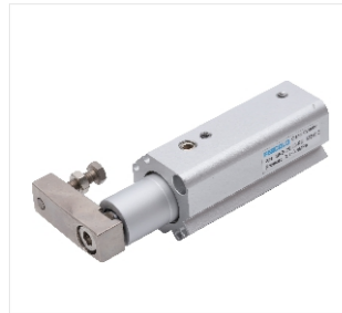
53. Model: MK-2 Rotary clamping air cylinder