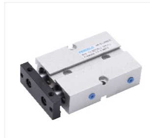
19. Model: TN Dual rod air cylinder